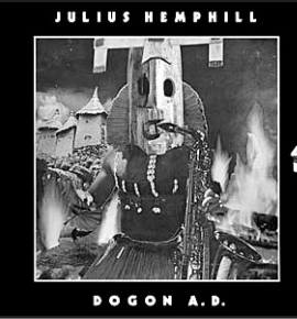
Dogon A.D. Julius Hemphill (Mbari-Arista/Freedom- International Phonograph)